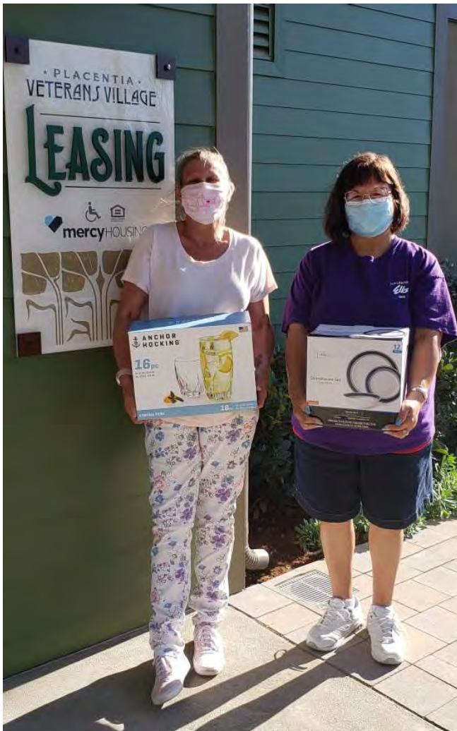
Fullerton Elks Lodge 1993